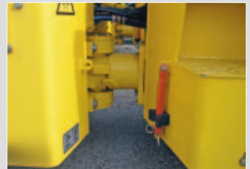
Bolt-on center-joint, with standard crab steer off-set, provides long life and ease of repair.