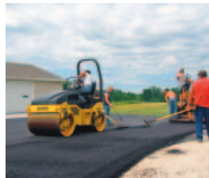
BW120AD-4 shown with optional folding ROPS.