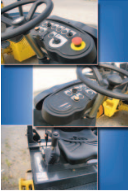
Ergonomically engineered operator's platform providing optimum comfort and maximum productivity.