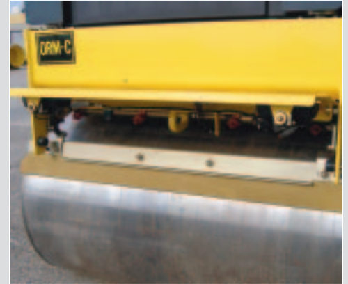
Wind protected, quick-disconnect spray nozzles with dual scrapers per drum.